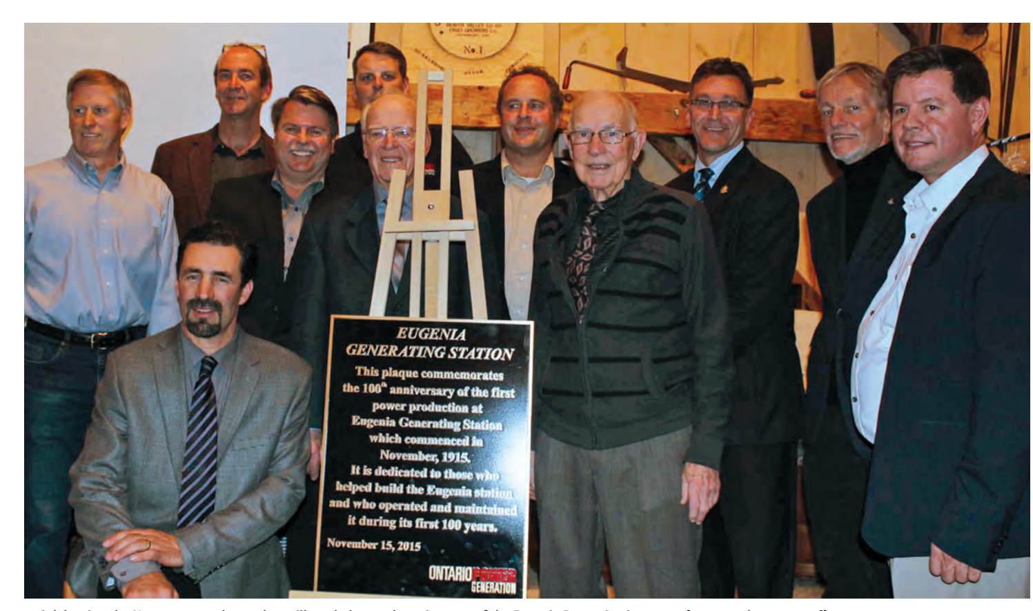
▲ Celebrating the Nov. 15, 2015 plaque that will mark the 100th anniversary of the Eugenia Power Station, were former and current staff members of Ontario Power Generation, and other dignitaries. The event was held at Beaver Valley Cidery.