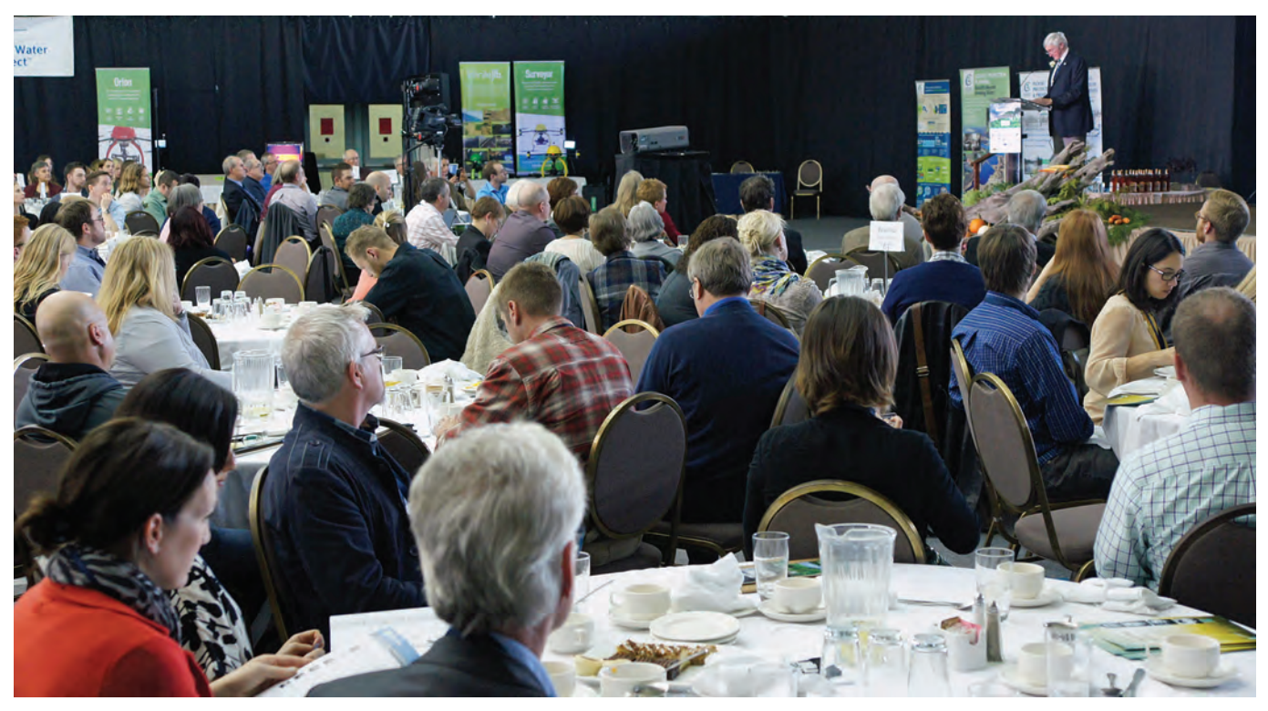
▶ Nov. 17 to 19 in Alliston, about 1,000 people attended the Latornell Conservation Symposium "Weathering Change: Navigating a New Climate."